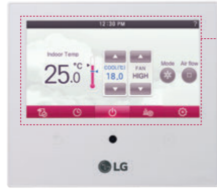
Full Touch Screen